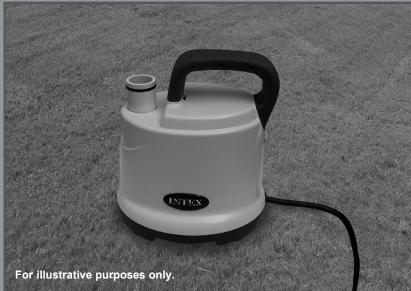
For illustrative purposes only.

Don't forget to try these other fine Intex products: pools, pool accessories, inflatable pools and in-home toys, airbeds and boats available at fine retailers or visit our website.